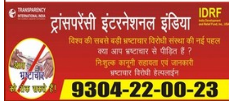
TII Team carrying out surveys and spreading awareness about Helpline

Corruption Helpline Number Stickers for Public Places