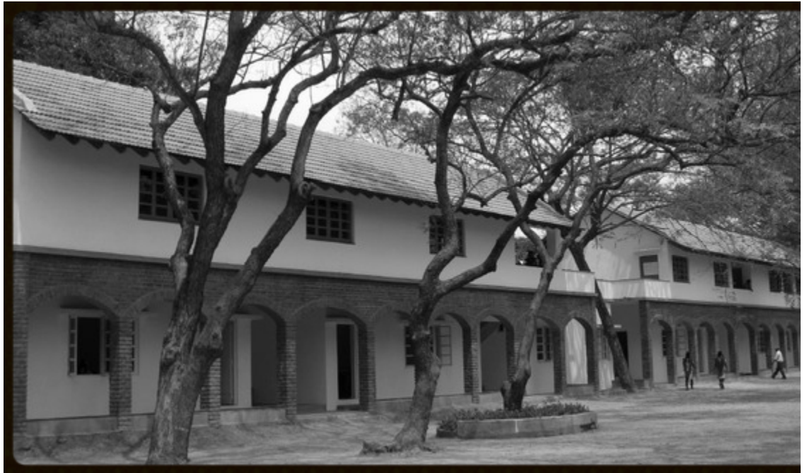
Udavi School Building

India Development and Relief Fund, Inc. 5821 Mossrock Drive | North Bethesda, MD 20852, USA Web: www.idrf.org | Tel: 301-704-0032 | Email: admin@idrf.org