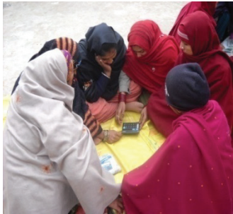
Women learning to use calculators

an incredible enhancement of women's self-esteem, confidence, and social recognition in their families and communities. The membership of SHGs provided a security of assured access for microcredit and a means to secure financial resources to alleviate poverty. Equipped with financial support from IDRF, and financial training from Arpana, there has been a profound transformation in their