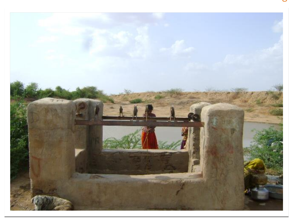
94% of villages assisted by our partner NGO had adequate water even though the region had 50% less rainfall than average in 2014

The Samerth team recognized the need for holistic water security plans as they developed micro plans to address this issue. It also created the twin opportunity of not only creating sustainable water resources but also arresting migration in the short run. A process was followed to ensure that, in addition to the administrative and governance bodies, the villagers owned the plan and ensured its success.