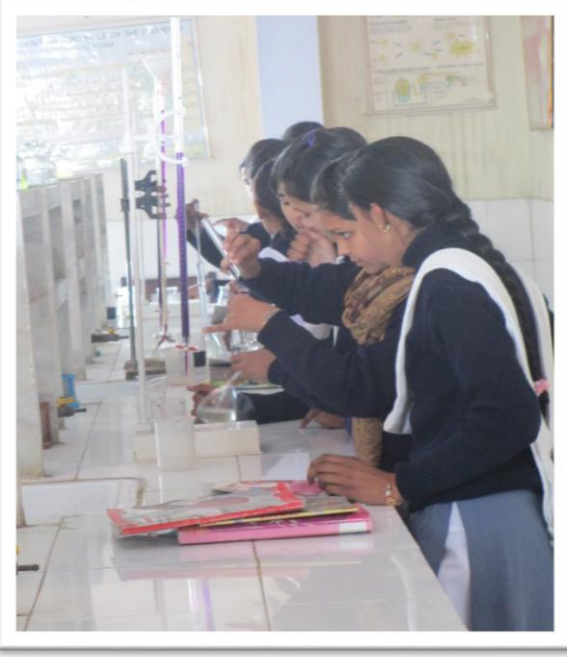
Girls in the Chemistry Lab

In 2014 , an IDRF grant enabled the school to build a computer lab to impart computer education and skills among the students.