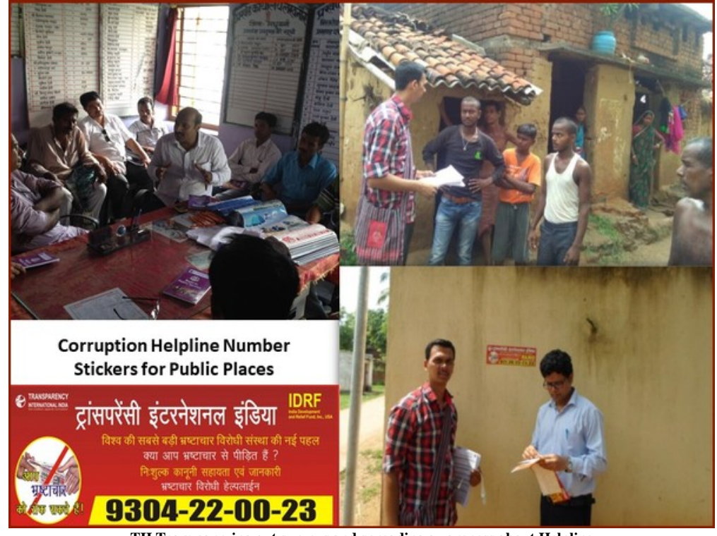
TII Team carrying out surveys and spreading awareness about Helpline

IDRF is a registered Trade Mark of India Development and Relief Fund, Inc.