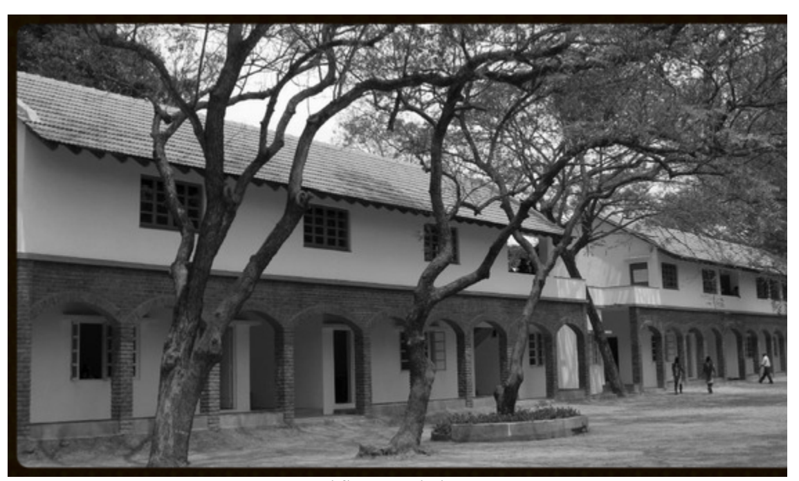
Udavi School Building

India Development and Relief Fund, Inc. 5821 Mossrock Drive | North Bethesda, MD 20852, USA Web: <a href="www.idrf.org">www.idrf.org</a> | Tel: 301-704-0032 | Email: <a href="mailto:admin@idrf.org">admin@idrf.org</a>