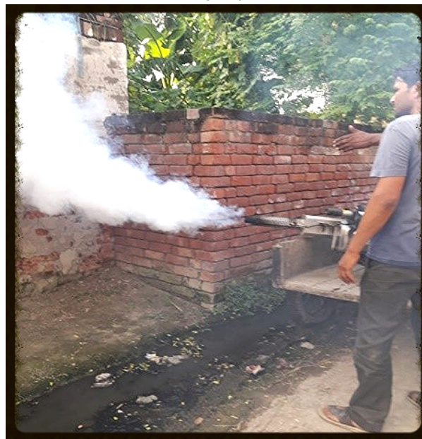
Fogging (anti-malarial sprays ) done by Gram Panchayats in their villages

Thank you once again....for your generosity and support to IDRF. Our mission to put power and not charity in the hands of those in need -continues ONLY because of YOUR compassion and commitment!