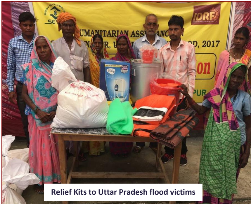
Relief Kits to Uttar Pradesh flood victims

IDRF started its disaster relief and rehabilitation programs in 1991 by sending grants to help the victims of the Uttarkashi earthquake and landslides. Since then IDRF has been sending relief and rehabilitating the communities in the aftermath of various natural disasters and national emergencies.