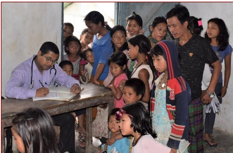
The medical center provides OPD and Path-lab services at an affordable cost to poor patients

100 anemic women are provided iron, folic acid and vitamin supplements.