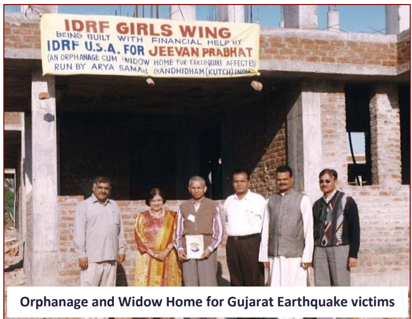
Orphanage and Widow Home for Gujarat Earthquake victims

During exceptional emergencies in the USA, we partner with local organizations to help those in distress like fundraising for the families of first responders in New York after the 9/11 terrorist attacks in 2001. We have now joined hands with the Indian-American organizations in the Washington DC metro area to help the families hit hardest by the COVID-19 pandemic.