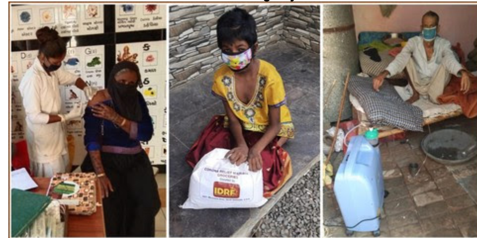
From April 26th to June 21st, 2021, IDRF has sent $617,955 to 14 states in India for COVID-19 relief efforts

IDRF is sending 100% of donations raised for pandemic relief to the beneficiaries without retaining any administrative costs.